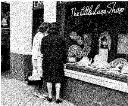
The Little Lace Shop

Brussels is a contrast with open idolatry, evident as passers-by stroked the statue of a man once murdered in the street. His side polished by thousands of fingers seeking some benediction. In a dank, dim church, wax effigies of diseased limbs are burned to the saints. Should healing result, the fortunate one presents a silver replica to augment the coffers.