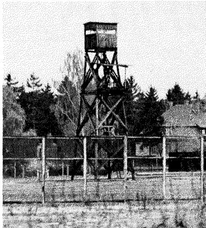
One of many

The Soviet War Memorial was another high point. It is a vast concrete rectangular structure which includes materials Hitler proposed to