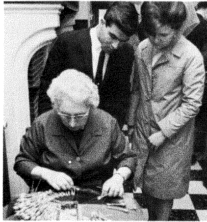
Nimble fingers at work

In the Church of the Holy Blood is a phial of sand soaked with Christ's blood. It used to turn to liquid every Friday. It doesn't now. But it is carried through the streets with pomp and ceremony by dignitaries in a priceless solid gold relicry studded with priceless gems, diamonds, rubies . . .