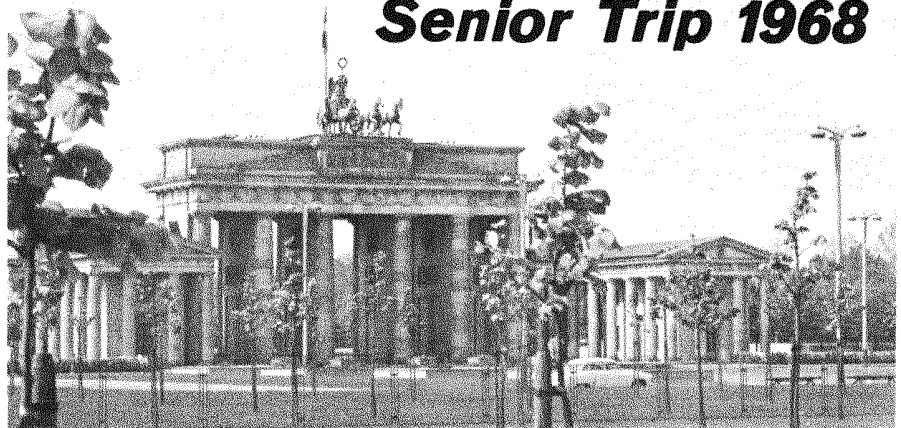
Symbol of a divided city (see articles inside).