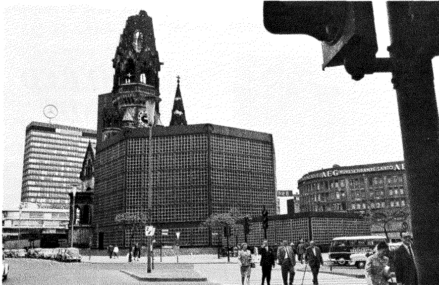
Centre of West Berlin

What a contrast! The West – exuberant – prosperous! The East – bleak and gruesome! And in between – No Man's Land, where no one dares to tread!!